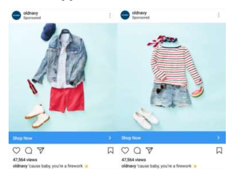
Example of a Sponsored Ad on Instagram

Unlike the name suggests this is more a display type of advertising than sponsoring as we know it and is defined in the AVMS Directive. Sponsored Ads are an option available to business accounts on Instagram, and allow the brand to promote their posts through paid ads. These ads appear on the target audience's home feed, with a direct link to either a website, e-store or back to the profile of the brand. This allows the brand to directly sell their product/service and consequently increase reach and following. Sponsored Ads are also considered good tools to promote contests and giveaways and increase the engagement of the audience with the brand.