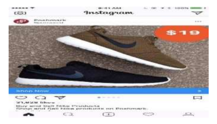
Example of a Carousel Ad on Instagram