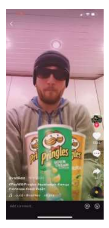
Example of a Branded Hashtag Challenge Ad on TikTok