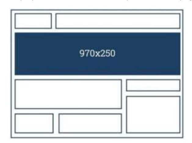
Example of a Masthead Ad on YouTube

Masthead Ads are a specific type of display ads on YouTube, which can cover a large area on the home page of the website and have maximum visibility. They are considered to belong to the most expensive advertising options on the YouTube app or website and are mostly used by businesses and brands with large budget. The size of home page Masthead Ads is typically 970X250 pixels, but these can only be displayed on desktops. In addition to this, Masthead Ads expandable of size 970X500 pixels can be displayed for 24 hours on the top of the home page of the YouTube website.