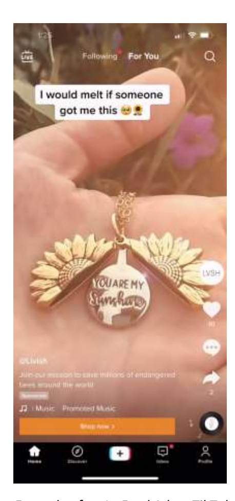
Example of an In-Feed Ad on TikTok