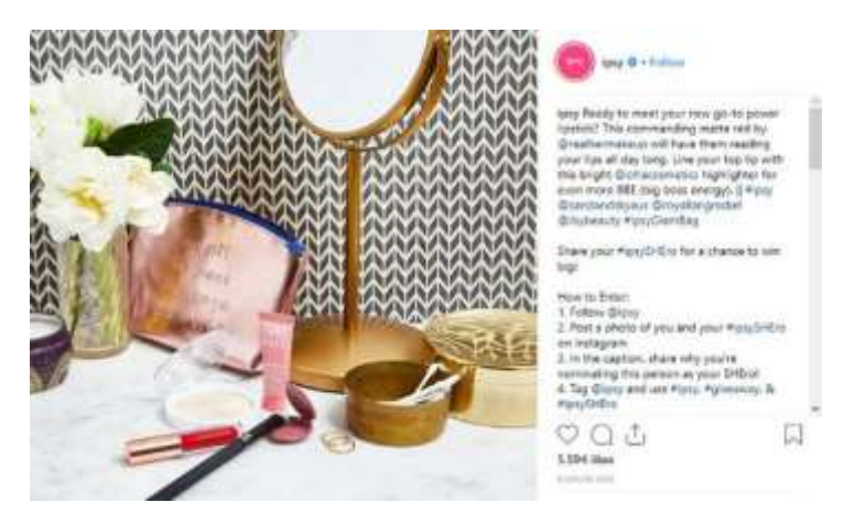
Example of a Photo Ad on Instagram

On a platform that was launched originally for photo sharing it will not come as a surprise that Photo Ads are a very common type of advertising. Once the photo sharing option was only a tool for Instagram account holders to share pictures with friends, family and other followers. Nowadays, the scenario has changed, and people are using photos to promote products, services, brands, events, and much more.