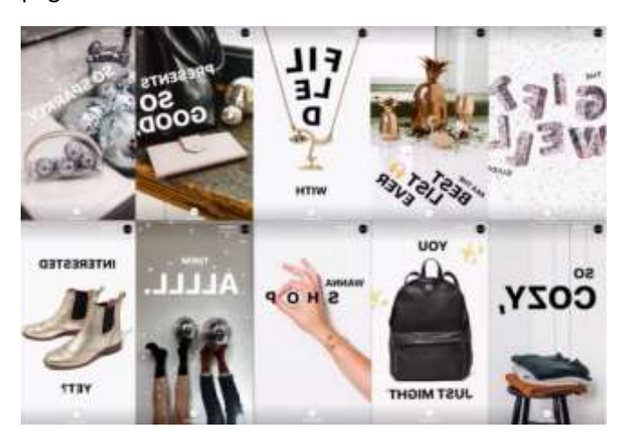
Example of a Story Ad on Instagram

Instagram stories are an extremely popular feature on Instagram and research claims that nearly 80% of the active users on Instagram posts stories at least 2-3 times a week. According to marketing specialists story ads are all about clever targeting and placement. Story Ads appear typically while a user is switching between the stories of different accounts. These ads are backlinked with a "swipe up" option, which leads back either to the brand's profile or to their website. Story Ads appear only for a few seconds before the next story appears, and once gone they cannot be revisited. While this seems a drawback, many brands nevertheless consider Story Ads as a great tool to redirect users to a brand's page and content.