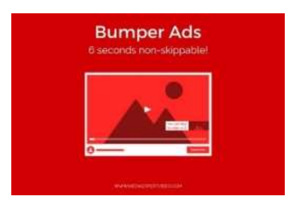
Example of a Bumper ad on YouTube

It is difficult to make an impression on the viewer with a just 6 seconds time slot, and such a short time must be used wisely and display attention-grabbing content. A good presentation can grab the attention of viewer and ask them for call-to-action (CTA). A link can be provided in the window of these ads which can either lead viewer to the website of the business or to longer videos. According to Google's own surveys the Bumper ads play an important role to boost the reach of long video promotion campaign. YouTube Bumper ads are also in standard video size so that they can be displayed and accessed on many devices.